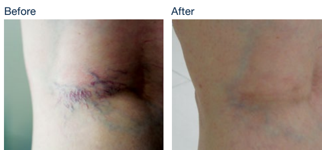
Leg veins treatment with Nd:YAG