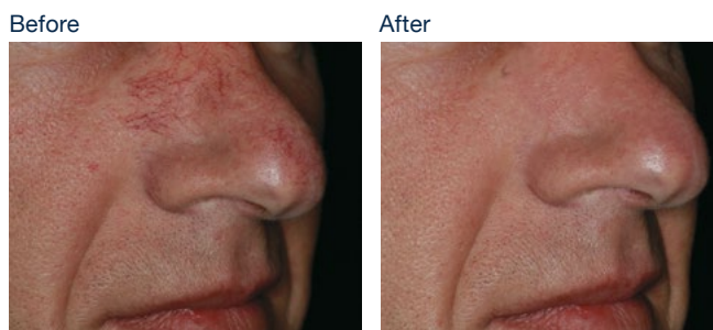
Vascular treatment with IPL

When I think about purchasing a new device, I think about the ROI, and how quickly I'm going to be able to pay for the device... And I was happy to see that we paid for the device in just few months, which I think is unbelievable!