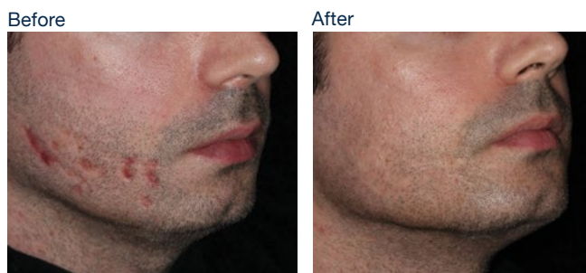
Skin resurfacing with ResurFX