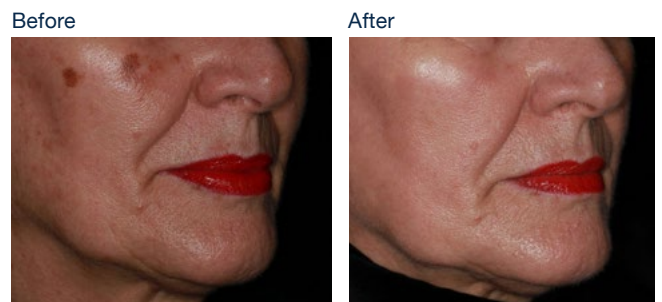
Photofractional™ treatment with IPL & ResurFX