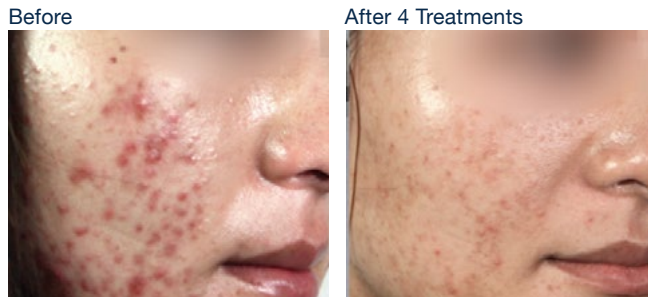
Acne treatment with IPL

The multi-platform capabilities of the Stellar M22 have been validated in numerous clinical studies and peer-reviewed articles. Practitioners all over the world have continuously reported high levels of patient satisfaction and repeatable results.