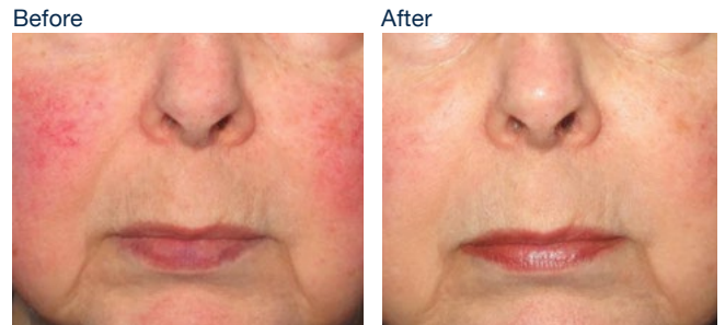
Rosacea treatment with IPL