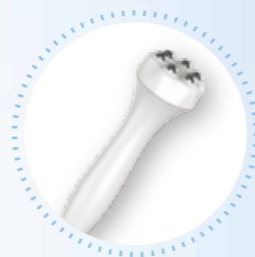
② Multi-polarity Electroporation