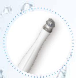
① Aqua Cleansing

AquaClean mini consist of 3-in-1 system that combines three different technologies including aqua clean system using vacuum, electroporation and double lifting. 3-in-1 system provides all facial care including cleansing, solution penetration and lifting to a single device.