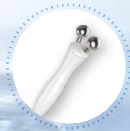
③ Double Lifting